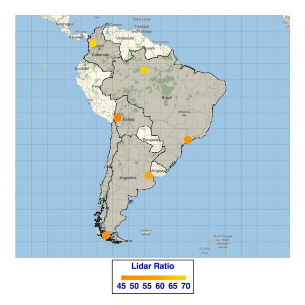
Figure 2: Lidar Ratios at some of LALINET's stations. These values should be updated and extended to other stations in order to have a regional representative values.

a routine and obtaining aerosol optical properties with regional representation and sparse events such as volcanic eruptions. Network capabilities are also under scrunity to comply with QA/QC protocols.